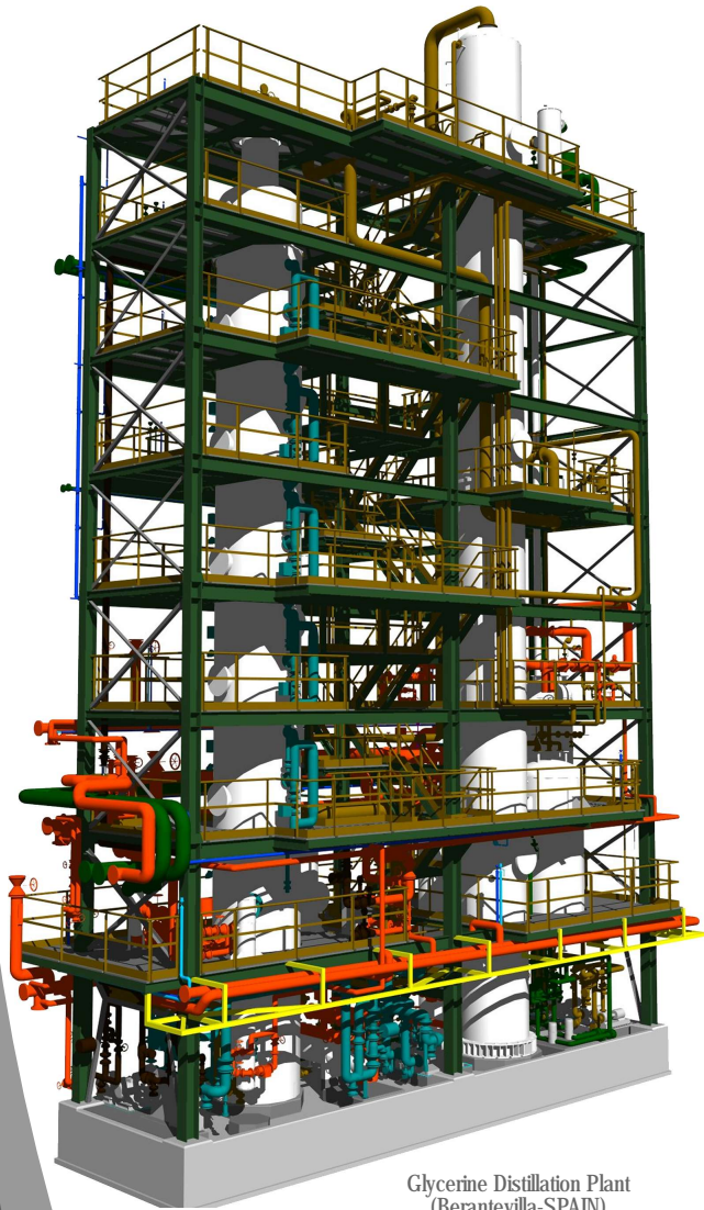
Glycerine Distillation Plant (Berantevilla-SPAIN)